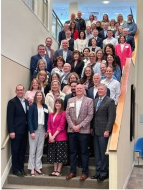
CEO Symposium of Consortium of Catholic Foundations 2026